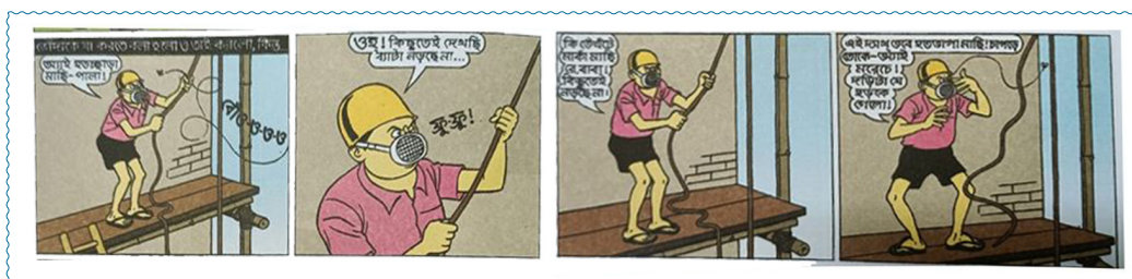
An Action-to-Action Transition from Narayan Debnath's Hada Bhoda Samagra (1962, p. 318)