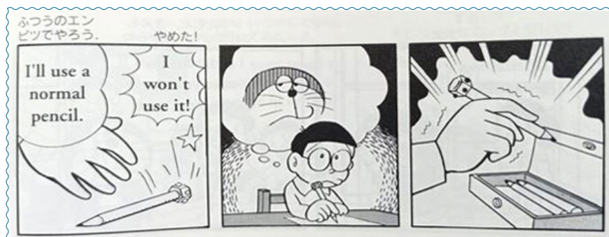
A Moment-to-Moment Transition from Fujiko F. Fujio's Doraemon Volume 1 (1974, p. 52)

When we look into speech act theory, 'moment-to-moment' refers to the continuous shift of communicative acts and conversations between the speakers present in the visual narrative. Each moment involves in the execution of speech acts such as affirmations, requests, or promises, which eventually shape the process of meaning and comprehension.