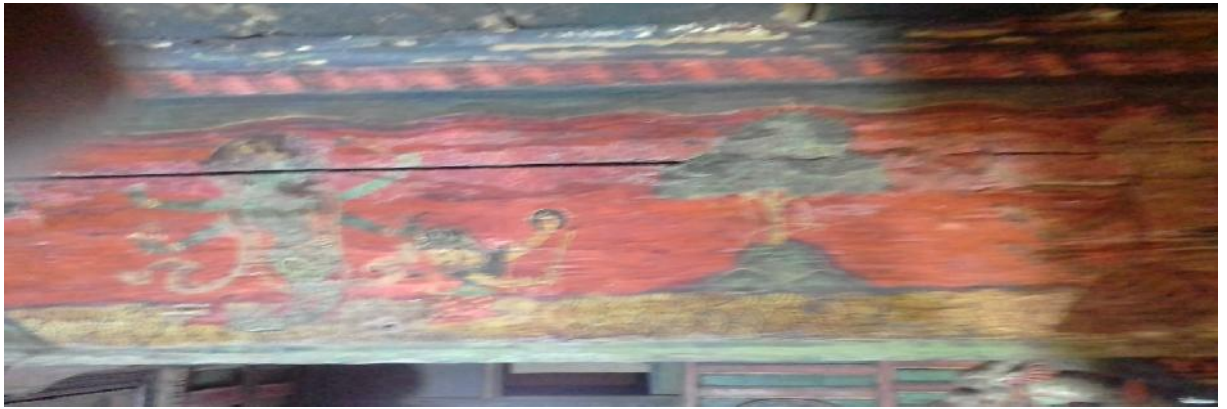
An illustrative wall painting of Pujari Math

Pujari Math is not only famous for wooden art but, it is also known as the center of beautiful and miraculous wall paintings of Nepal. There are some illustrative paintings belonged to 16 th to 17 th century of Christian era in the walls and ceiling of the main sanctorum. More or less the paintings are painted by using polychrome. The door flakes, wings, entablature, pillars, beem , dalin , wall and other portions of the room are fully decorated by the beautiful polychrome paintings (Dulal, 2019a, p. 274).