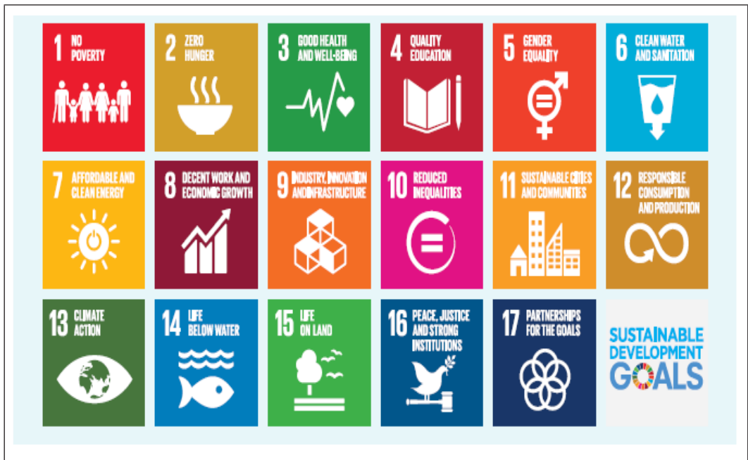
Figure 1: 17 agendas of United Nations Sustainable Development Goals

The SDGs have been well-integrated into Nepal's national development framework. Nepal has developed the SDGs status and roadmap 2016-2030, SDGs needs assessment, costing and financing strategy, and SDGs localization guidelines that spell out baselines, targets and implementation and financing strategies for each SDG. Nepal has made commendable efforts for the implementation of the SDGs since its adoption. However, different calamities, disasters and the circumstances that