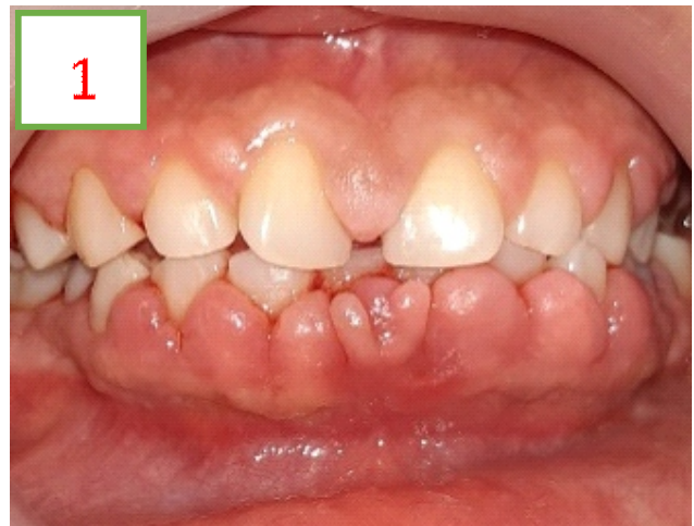
Figure 1: Initial clinical presentation of AIGE

During the follow ups at one month's post-operatively and six months post-operatively, results were fairly maintained with a nice positive gingival architecture, devoid of bleeding on probing, normal sulcus depth of around 2-3mm, all suggestive of normal gingival health (Figure 5 and 6). Scaling was performed on every follow up as a part of periodontal maintenance.