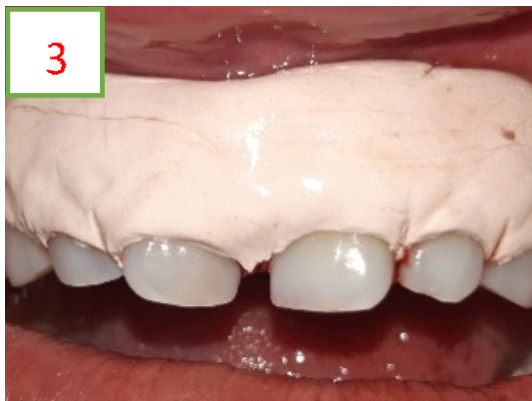
Figure 3: Application of periodontal dressing