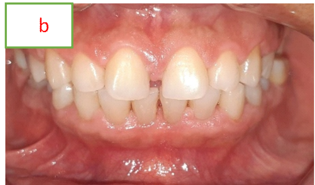
Figure 5: Post-op pictures showing stable results at a: 1month, b: 6 months