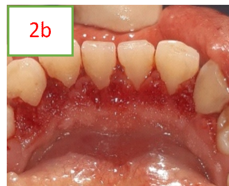
Figure 2a and b: Gingivectomy and Gingivoplasty procedure