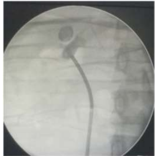
Figure 2: Fluoroscopic guided estimation of the ureterscope and the diverticular stone