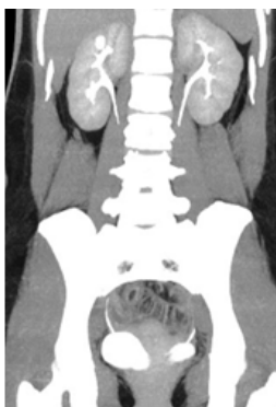
Figure 1: Preoperative CECT Image