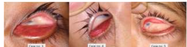
Figure 2: Figure 2 Retraction of eyelid revealed the microphthalmic eye in cases 3,4,5. Microphthalmic eye could not be visualized on case 6 despite retraction.

In our case series, we found that uveal coloboma in the other eye was present in only 50% of the cases. The three cases had complete uveal coloboma (Iris and retino choroidal coloboma). The other three cases had normal eyeball with visual acuity of 6/6 and no evidence of uveal coloboma on the slit-lamp anterior segment examination and binocular indirect ophthalmoscopic fundus examination.