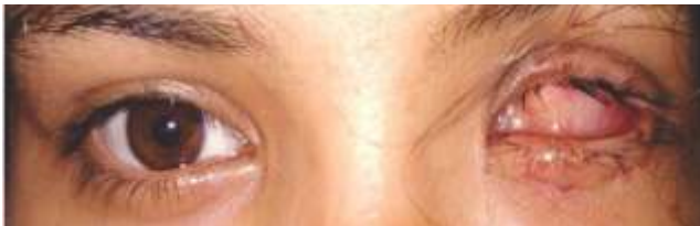
Figure 5: postoperative appearance of case no 5 after 6 weeks