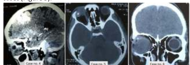
Figure 3: CT scan reveals a large orbital cyst associated with microphthalmos in cases 4,5 and 6. Note very large cyst with small superoposteriorly displaced microphthalmos in case no. 6 which was not visualized on manual retraction.

B-scan ultrasonography was done for all cases, which demonstrated a large cyst in the inferior and anterior part of the orbital cavity of the involved eye. We did not find any stump, presumed to be optic nerve stalk, in the posterior aspect of the cyst in our cases. Computed tomography (CT) scan of head and orbit was done for case no. four and the cases undergoing surgery (case five and six). CT scan revealed a large cystic mass in the inferior orbit with a microphthalmic eye in the superior part of the orbit in all the cases (Figure 3).