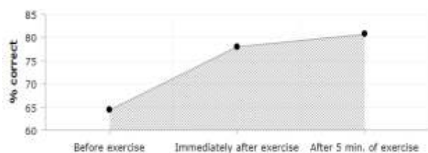
Figure 2: Change in percentage correctness of 2n back text in relation to exercise intervention.

Figure 2 presents detailed working memory performance based on the three sessions of 2n back task with exercise intervention. To explore the working memory performance difference between baseline and exercise sessions, a paired t-test was used to for the test of significance.