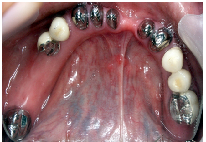
Figure 5a & 5b: Cobalt chrome framework

The cobalt chrome framework was highly polished after final glazing of porcelain fused to metal crowns and occlusion was adjusted on the articulator and conferred to bilateral group function. (Figure 5a, b) The maxillary fixed prosthesis was cemented using GIC (FUGI I, GC corporation, Tokyo, Japan). (Figure 6a, 6b)