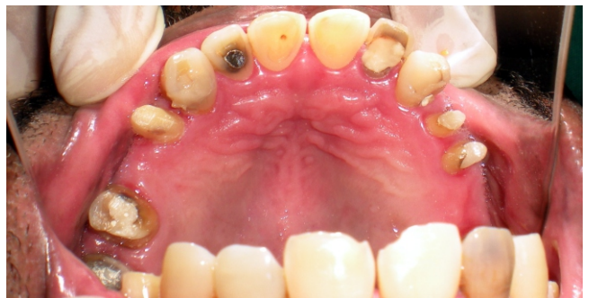
Figure 2: Tooth preparations of 14, 16, 17, 24, 25, 27

Tooth preparations of 14, 16, 17, 24, 25 and 27 were modified, followed by gingival retraction and impression was made