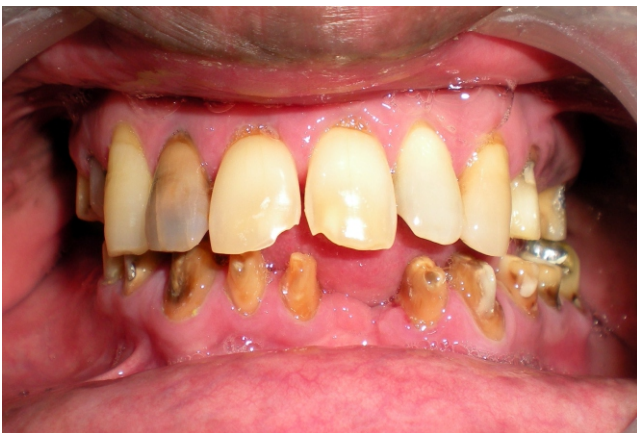
Figure 1: Preoperative view

Intra orally, the prominent features were as follows: the patient had undergone mandibular fixed prosthesis treatment few years back, which had dislodged and the patient was not more using it from past few months, partially edentulous maxillary arch with missing 15, 16,17 and partially edentulous mandibular arch with missing teeth as follows 31, 37, 46 and 47 (Figure 1).