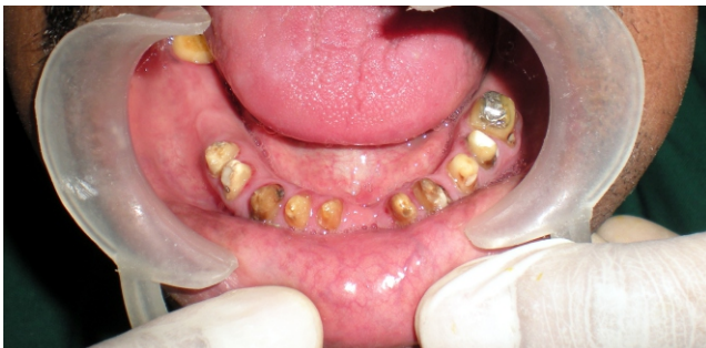
Figure 4: Cemented coping

During the modifications of tooth preparations it was taken care that tooth preparations were modified to achieve near parallel axial walls wherever possible. This is because parallel the walls of the coping, the greater mechanical friction interlocking of the coping with the overlying crown. The parallel axial walls of short teeth offer better resistance form. 5 Grooves were prepared in buccal and lingual walls of the abutments to achieve more retention. Wax pattern were fabricated with cervical shoulder, surveyed to check their parallelism and were cast in chrome cobalt alloy. Cast coping