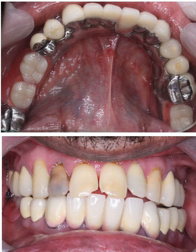
Figure 7a & 7b: Post Operative View

The mandibular definitive prosthesis was checked intra orally in patient's mouth and intra oral fit, retention stability and occlusion was verified. (Figure 7a, b) Instructions were given to the patient regarding using prosthesis and for regular cleaning of the prosthesis at night and oral hygiene instructions were emphasized. The patient is being followed up regularly and is satisfied with the performance of the prosthesis. There is no complaint of any pain or discomfort in TMJ region.