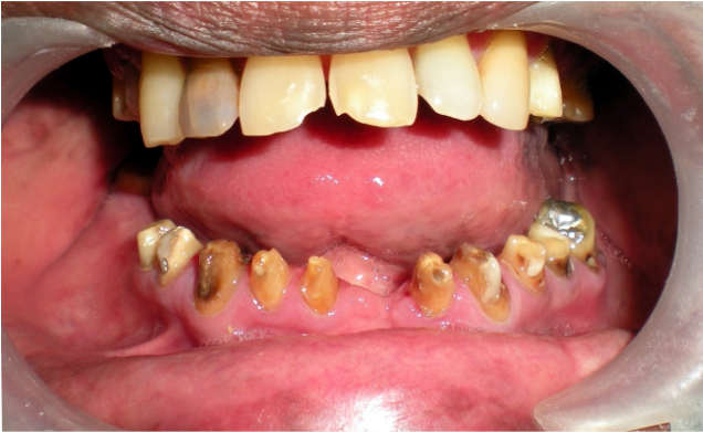
Figure 3: Tooth preparations of 32, 33, 34, 38, 41, 42, 43, 44, 45, 46

In the mandibular arch tooth preparations were refined and modified wherever possible to receive cast metal copings. Excessive modifications to the tooth preparations could not be done due to loss of tooth structure in previous fixed partial denture prosthesis (Figure 3). Following gingival retraction, impression of mandibular arch was made using polyvinyl siloxane impression material (Reprosil, Dentsply India). Heat cured provisional restorations (DPI heat cure tooth molding powder, DPI, India) was fabricated and tried on semi adjustable articulator and adjusted to Bilateral Group