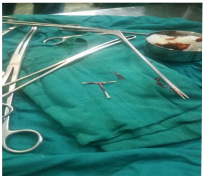
Figure 1. IUCD with no string

Before starting laparotomy, IUCD with missing thread was removed with forceps. Laparotomy was proceeded, and the findings were – hemoperitoneum of 1.5litres, right tube edematous, bulge at ampula, oozing from the fimbrial end. Right total salpingectomy with peritoneal lavage was done. Patient was stable throughout and in postoperative period. Patient did well and was discharged on third post-operative day.