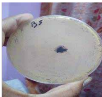
Fig 5. Antimicrobial Activity of Sample against Bacillus subtilis .