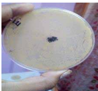
Fig 4. Antimicrobial Activity of Sample against E. coli .

The zone of inhibition of the sample after the incubation for 48 hours is observed as 0.5mm, 0.6mm, and 0.7mm for the test organisms E. coli , Bacillus subtilis , and Aspergillus niger (fungi) respectively. For E.coli and Bacillus subtilis , the zone of inhibition for positive control neomycin was determined to be 16mm and 14mm, respectively. Similarly, for the negative control, the 1% dimethyl sulfoxide zone of inhibition was found to be 0.0mm for both bacteria. Zone of inhibition for Aspergillus niger for positive control ketoconazole was found to be 1.1 mm and 0.0mm for negative control 1% dimethyl sulfoxide. From these results, it can be concluded that nanoparticles show very minimal antimicrobial activity due to the occurrence of low values of the zone of inhibition. Figure 4 shows the antimicrobial activity of a sample against E. Coli whereas Figure 5 shows the antimicrobial activity of a sample against Bacillus subtilis . In Figure 6, we show the antimicrobial activity of samples against Aspergillus niger .