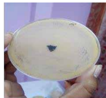
Fig 6. Antimicrobial Activity of Sample against Aspergillus niger .