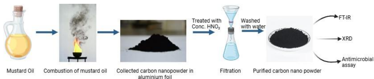
Fig 1. Schematic Diagram of the Synthesis of Carbon Nano Powder.