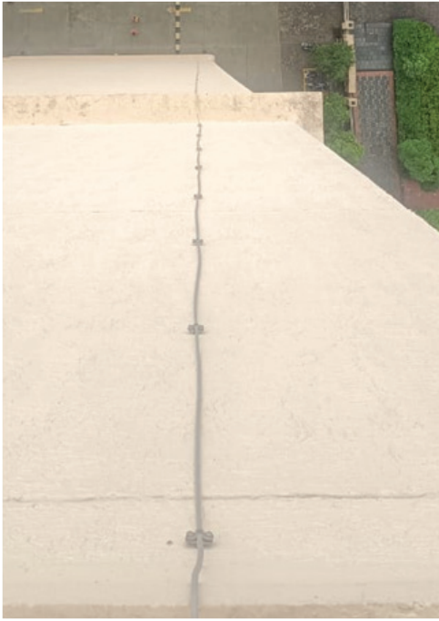
Fig. 5. Down-conductor from the terrace