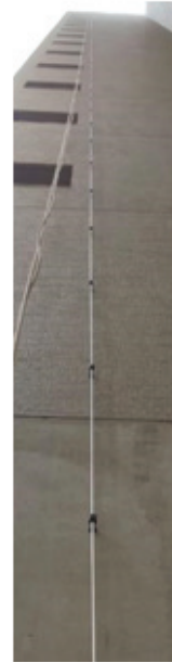
Fig. 9. Downconductor view from the ground floor