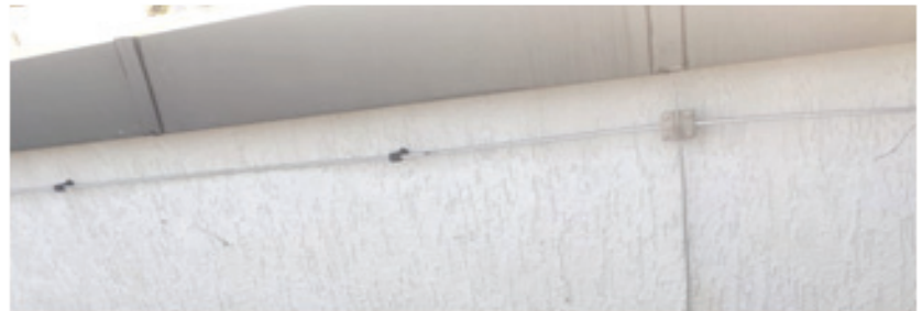
Fig. 11. Aluminium conductor near the glass façade