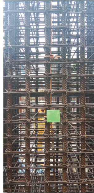
Fig. 13. Provision for Equipotential Bonding with RCC column before concreting