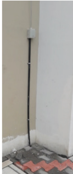
Fig. 8. Insulated conductor from the test joints