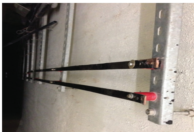
Fig. 4. Cut piece of down conductor in shaft