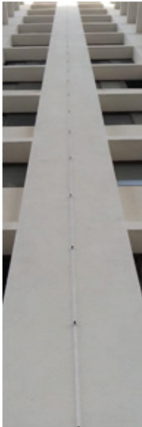
Fig. 7. Downconductors view from the ground floor.