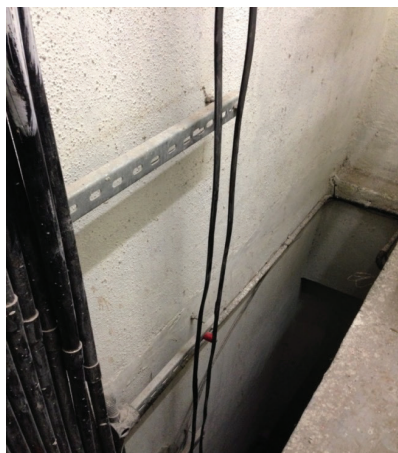
Fig. 3. Insulated copper strip through the electrical shaft