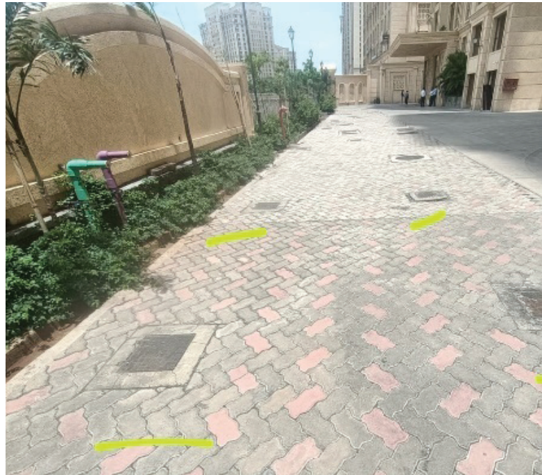
Fig. 6. LPS and LV earth pits