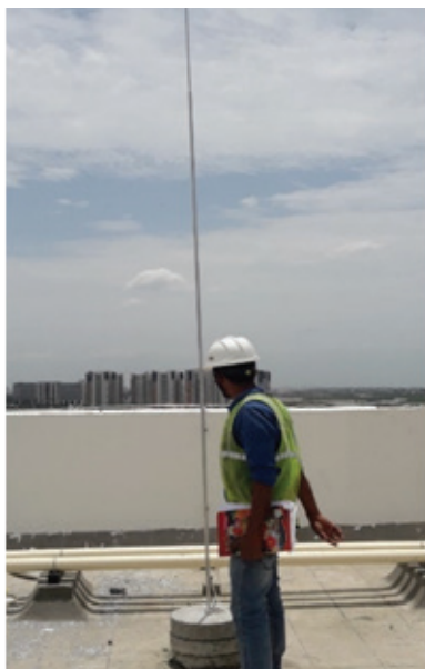
Fig. 10. Air terminal near the metallic water pipe