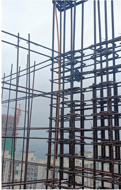
Fig. 12. Downconductors through RCC column