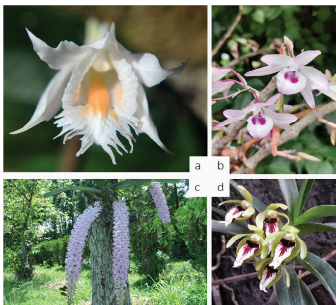
Figure 1: Some orchid species of anticancer sources; Dendrobium longicornu (a), D. transparens (b), Rhyncostylis retusa (c) and Vanda cristata (d).

for medicinal plants intended for use by traditional Ayurveda and modern pharmaceutical companies as source for novel drug candidates is on the rise. Therefore, the trade of medicinal plants becomes an important source of revenue to the Nepal government and supports substantially the livelihoods of communities, particular in rural settings. Medicinal plants have enormous therapeutic potential and may have few side effects. 6 The search for anticancer agents from plant sources started back in the 1950s, when cytotoxic vinca alkaloids (vinblastine and vincristine) and podophyllotoxins (etoposide and teniposide) were isolated. 7 Furthermore, several anticancer agents derived from plants, including taxol ( Taxus brevifolia ), vinblastine and vincristine ( Catharanthus roseus ), camptothecin derivatives ( Camptotheca acuminata ), podophyllotoxins ( Podophyllum peltatum ) are in clinical use, and followed by a number of promising agents in preclinical or clinical development. Examples are flavopiridol, roscovitine, combretastatin A-4, betulinic acid and silvestrol. Since synthetic anticancer drugs are expensive and not easy to access for everybody in Nepal. There is a need to search for novel anticancer compounds in plants, particular herbs, which are rich in compounds with high polyphenol and flavonoid contents. Compounds rich in polyphenol and flavonoids exhibit high antioxidant activities, which property plays an important role for the treatment of cancers. 8