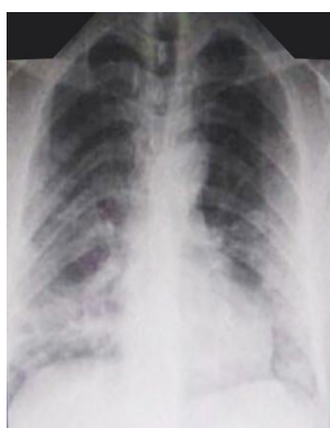
Fig. 1 Chest X-ray during admission

Patient was kept on Oxygen support with nasal prong at 3L. Patient was given antibiotic Montaz 1gm, solumedrol 80mg, PCM 1gm(stat), enoxaparin 40mg, metronidazole 400mg in Injectable form. Vitamin supplements and zinc supplement along with Ayurvedic cough syrup (Syp crux+kasturibhusan rasa), Lianhua qingwen which is a TCM herbal medicine and cupping therapy were given. Liver tonic was also started. Vitals were monitored 6 hourly. Till day 3 patient was stable and same medicine was continued. But on the 4th day he developed shortness of breath and Spo2 dropped to 85-87%. He was