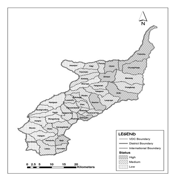
Figure 2: Panchthar: VDCs by large cardamom producing categories

Large cardamom is grown in both fertile and unproductive marginal lands irrespective of irrigation facilities. It is mostly grown under the shade of Alder ( Uttish ) trees. Alder enriched soil is suitable for large cardamom due to high nutrient content and shade loving nature. In recent years, the cultivation of large cardamom has been expanding and replacing areas suitable for rice and maze too due to its high market value.