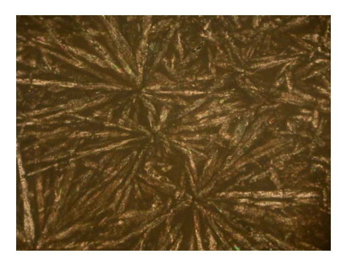
Fig. 3: Directionally solidify optical microphotograph of U-ABT eutectic