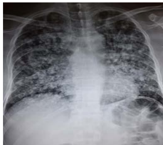
Figure-2 : The CXR following the treatment of AOSD

function. The patient developed breathlessness after two days and repeat echocardiography revealed a moderate pericardial effusion. Pericardiostomy and pericardial biopsy was done. The pericardial fluid was negative for pyogenic culture, TB culture, and gene Xpert. Histopathology of pericardial tissue revealed no granuloma or evidence of malignancy but showed evidence of an inflammatory response. As the currently used criteria were fulfilled, we made a diagnosis of ASOD and the patient was commenced on Non-Steroidal Anti Inflammatory Drugs and subsequently high dose steroids (50mg). Fever subsided and the pericardial effusion completely resolved within one week. After two weeks of symptom free interval he presented again with fever, cough, and worsening breathlessness. Repeat CXR revealed bilateral patchy consolidation (figure-2).