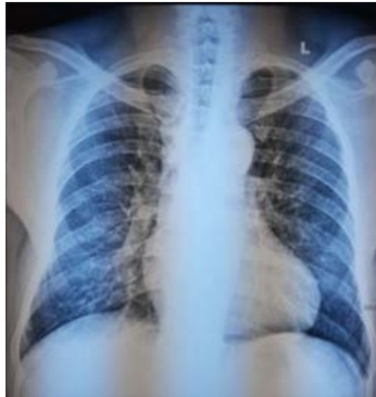
Figure -1 : CXR at the disease onset

Transthoracic echocardiogram showed thin pericardial effusion with normal left ventricular