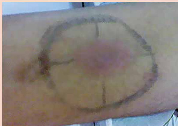
Figure 2: Positive induration of MT