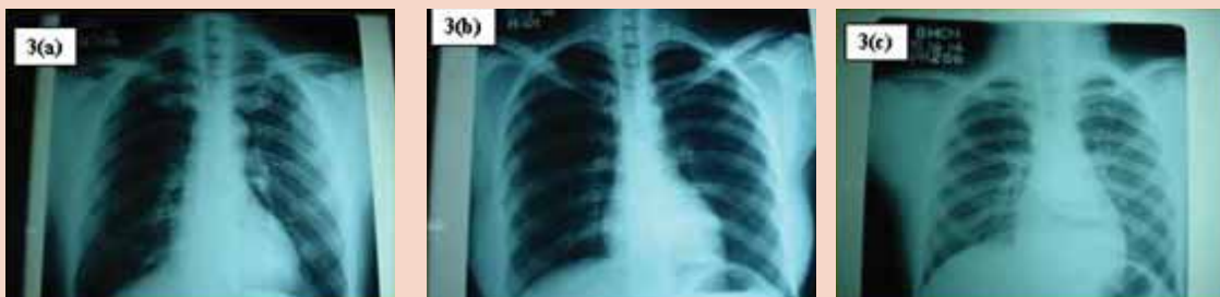
Figure 3: Chest X ray of Father (a), Mother (b) and Brother (c)