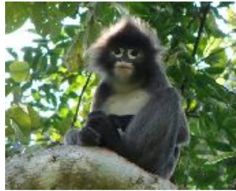
Figure 3. Phayre's Leaf Langur Trachypithecus phayrei