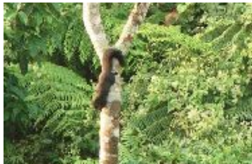
Figure 7. Orange Bellied Himalayan Squirrel Dremomys lokriah