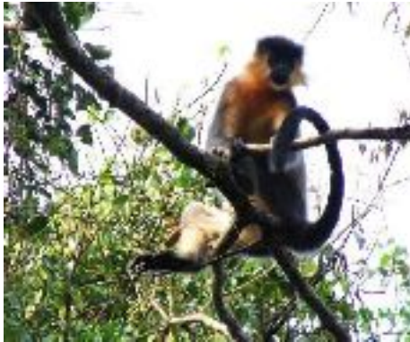
Figure 2. Capped Langur Trachypithecus pileatus