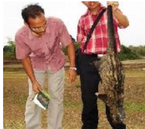
Figure 5. Common Palm Civet Paradoxurus hermaphrodites killed by villagers because of retaliatory causes