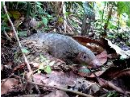
Figure 6. Chinese Pangolin Manis pentadactyla