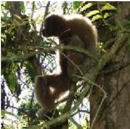
Figure 4. Western Hoolock Gibbon Hoolock hoolock