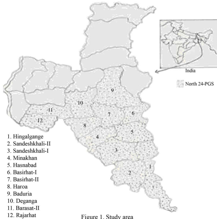
Figure 1. Study area