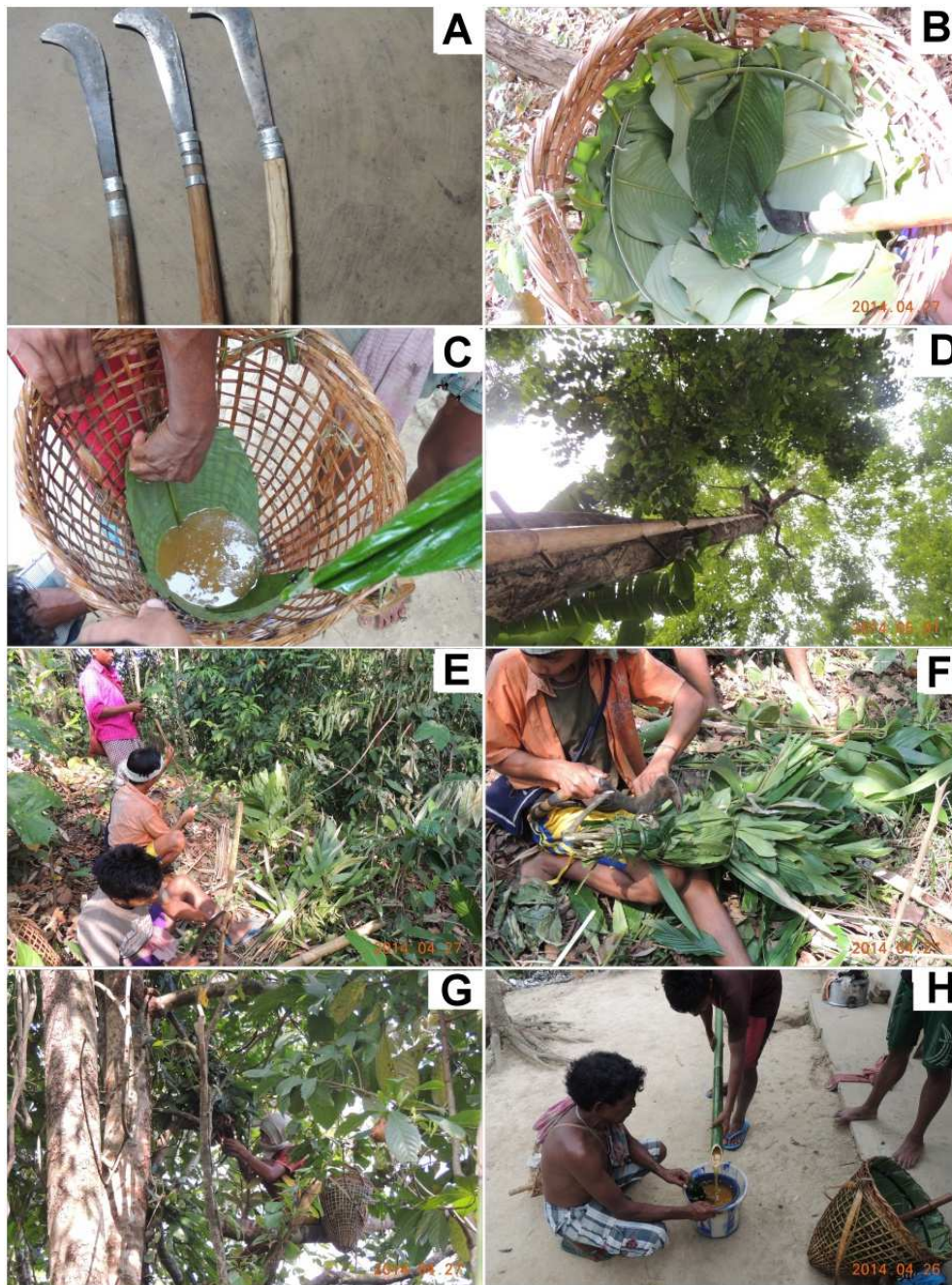
Figure 2. Honey collection procedure by Pnar community: A) Knife used during honey collection, B) Khara lined with Phrynium leaves, C) honey collected in a Khara , D) Jinkein used for climbing trees, E) Preparation of smoke torch, F) preparation of torch using Alpinia leaves, G) Man climbing tree with smoke torch, H) Filtration of honey.