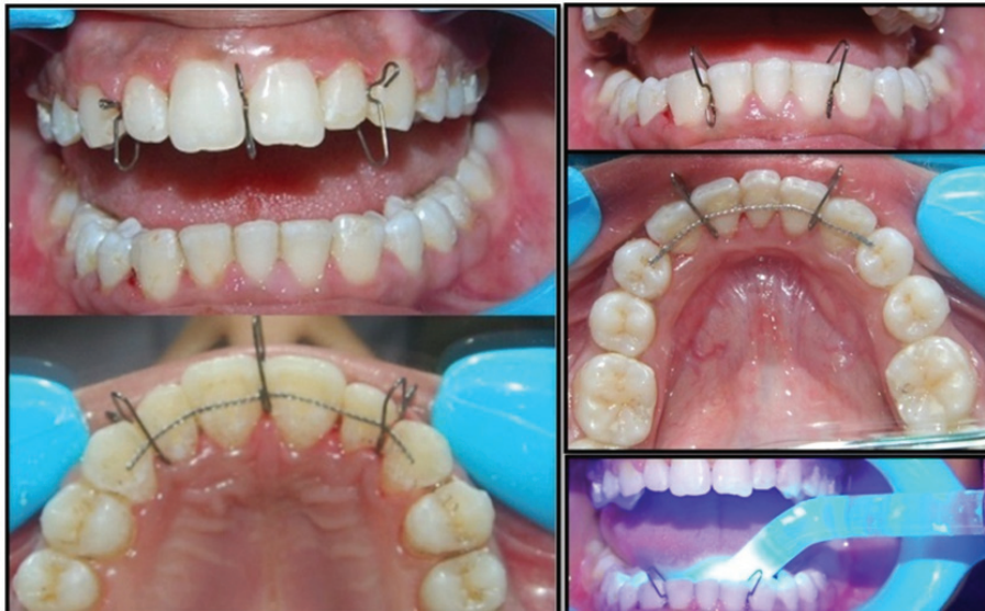
Figure 4: Intraoral used during fixation of retainer

soft braided wire, 0.0195 inch dead soft co-axial wire, twisted 0.09 or 0.010 ligature wire. 2,3 The preformed wire is first placed passively on the lingual surfaces of upper and lower canine to canine and stabilized with magic clips. Number of clips used varies from 2-3. Generally upper and lower arch requires 3 and 2 clips respectively. Following 10–15 seconds pumicing, the lingual surfaces of canine to canine are etched for 30 seconds. We find Transbond H L.C. is a good composite to use because of the high filler content, reducing the risk of failure. After carefully drying the teeth with moisture and oil-free air, an etched appearance can be seen on all six lower anterior teeth. A small amount of composite needs to be placed on the lingual surface of lower 3-3 and subsequently cured (Figure 4). The amount of composite should be big enough to cover the wire only in the middle of the crown and not all the way along the crown surface. It must be stressed that a good moisture control is an absolute requirement for successful use of a bonded retainer. The patient is then given specific oral hygiene instruction on how to use super floss under the