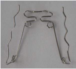
Figure 3: Biomex Quad Helix wire placed on the working cast and outline of the anterior bite plane is drawn with lead pencil