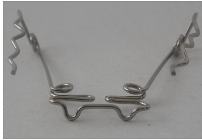
Figure 4: Biomex Quad Helix (rear view)