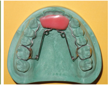
Figure 6: Biomex Quad Helix on the maxillary cast

working cast and outline of the anterior bite plane is drawn on the cast with a lead pencil (Figure 3). Acrylic anterior bite plane is added to this anterior extension keeping the anterior helices exposed (Figure 4, 5, 6).