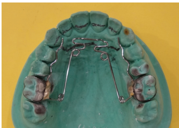
Figure 1: Biomex Quad Helix wire showing modified anterior bridge

The appliance is made of 0.036 inch stainless steel wire soldered to the stainless steel bands on permanent first molars. The anterior bridge of the quad helix is modified by extending it anteriorly. Two symmetric v-bends are placed in the anterior extension wire in the vertical plane (Figure 1, 2) keeping at least 2-3 mm clearance from the anterior palate and alveolar process. These two vertical v-bends along with the horizontal bends at both lateral ends of the anterior extension wire provide sufficient retention, stability and resistance against rotation for the acrylic anterior bite plane. After the wire is soldered to the stainless steel bands; it is placed on the