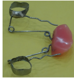
Figure 5: Biomex Quad Helix (lateral view)