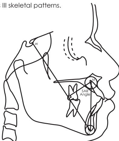
Figure 1: SAR angle

The aim of this study was to define the mean values and standard deviation for this angle in subjects with Class I, Class II and Class III skeletal patterns.