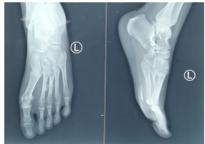
Fig. 1: X-ray Left foot showing radiopaque foreign bodies in plantar aspect

A 16-year girl presented to our outpatient department with complaints of pain and swelling over the lateral aspect of the plantar surface of her left foot for a duration of 4 months which was gradually progressive and increasing in severity causing hindrance to her daily activities. At the time of the presentation, she was reluctant to bear weight on the same foot. She recalls having a glass cut injury over the same foot 4 years back for which she was taken to a local hospital where pieces of glass were removed from the wound which