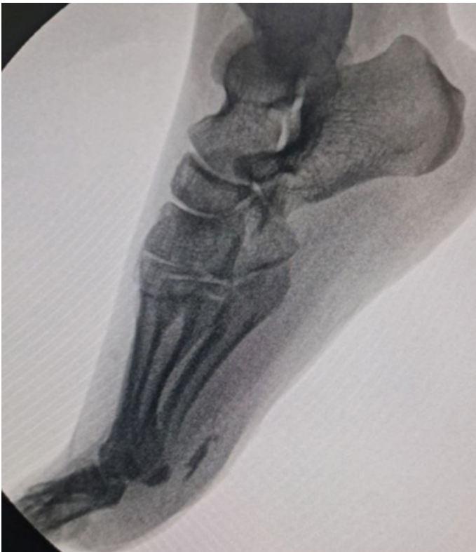
Fig. 2: Intra operative fluoroscopy image

using a probing technique with a syringe needle and fluoroscopy. Multiple pieces of glass were present along the longitudinal fibers of the plantar fascia. These fibers were dissected along their alignment to remove six pieces of glass, the largest one measuring 18x05 mm. Fluoroscopy was done to ensure complete removal.