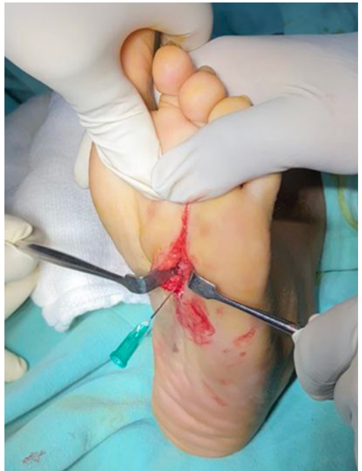
Fig. 4: Glass piece localization via probing technique with syringe needle