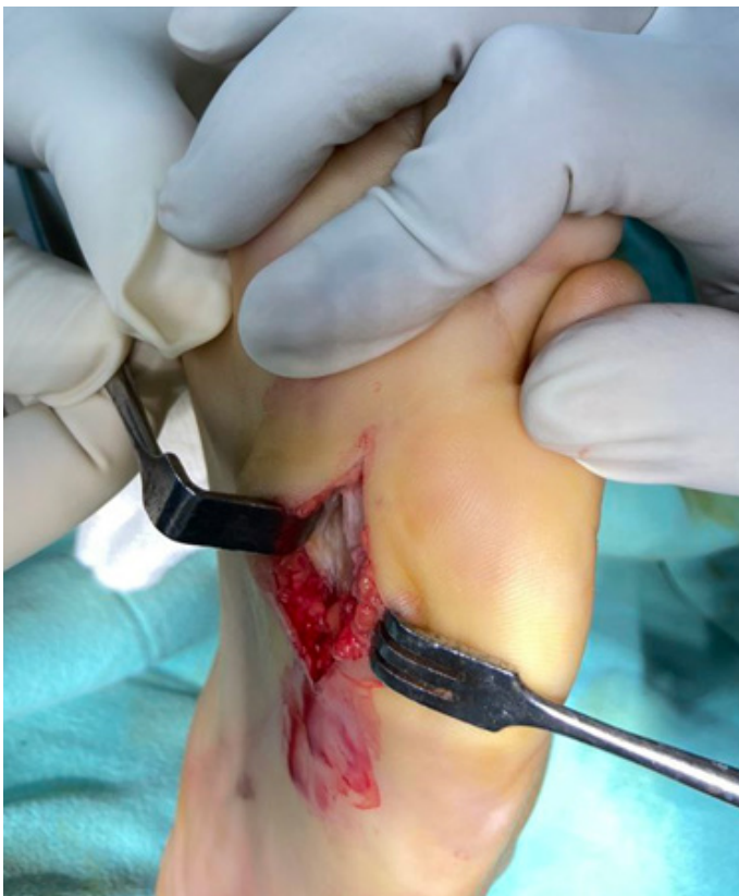
Fig. 3: Glass pieces embedded in plantar fascia