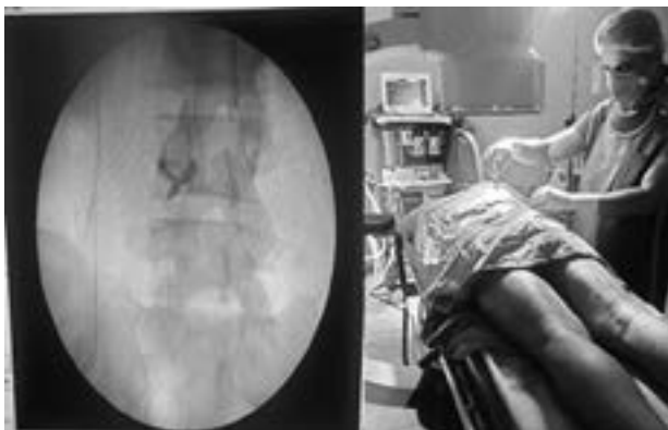
Figure 2: A. confirmation of correct placement of spinal needle with dye injection B. Injection of the steroid mixed with lignocaine after confirming correct placement of spinal needle

Numeric Rating scale (NRS) and Roland Morris Disability Questionnaire (RMDQ) were recorded pre-procedure, and at 1 week, 1 month, 3 months and 6 months follow up and statistical analysis was done using SPSS version 24.