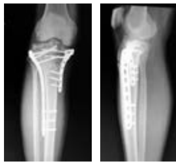
2d- Follow up