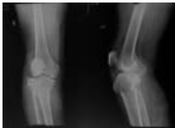
2a – Preoperative