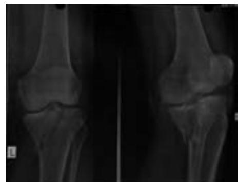
Fig. 1a – Preoperative