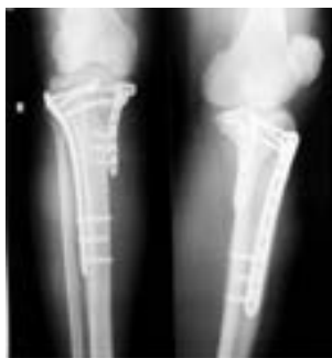
2c – Immediate post-op