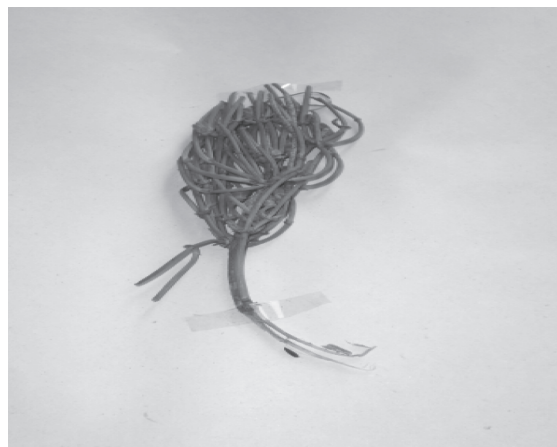
Plate 4- Ephedra gerardiana

A rigid tufted gymnospermous shrub about 1m high. Stem much branched whorled spreading. Leaves reduced to 2 toothed sheaths. Branches smooth, slender, green and jointed. Plants are dioecious, male flower ovate, 6-8 mm long with 4-8 flowers. Female cones usually solitary and yellowish, ovules ovoid, 7-10 mm surrounded by fleshy red succulent persistent bracts enclosing two seeds. (Plate 4)