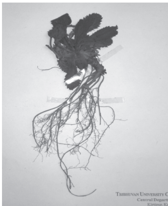
Plate 7- Neopicrorhiza scrophulariflora

and winged, oblanceolate. Flowers dark blue purple, flowering: July – August in a dense terminal spikes arising from a rosette of conspicuously toothed leaves, spikes 5-10cm long, Fruits capsule; October – November 6-10mm, Rhizome is bitter.(Plate 7)