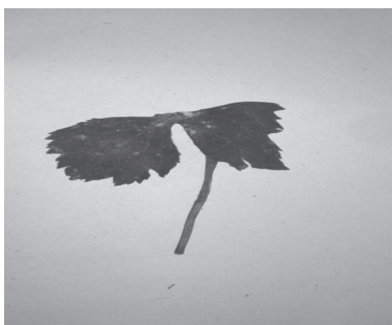
Plate 9- Podophyllum hexandrum

An erect perennial herb about 15-40cm tall. Leaves usually two, deeply three lobed. Long stalked, orbiculate to cordate. Lobes obovate, acuminate, serrate. Flowering time May - June, cup shaped, 2-4 cm across, large white or pale pink. Fruiting time: July - September, ovoid, 2.5-5cm long, scarlet when ripe.(Plate 9)