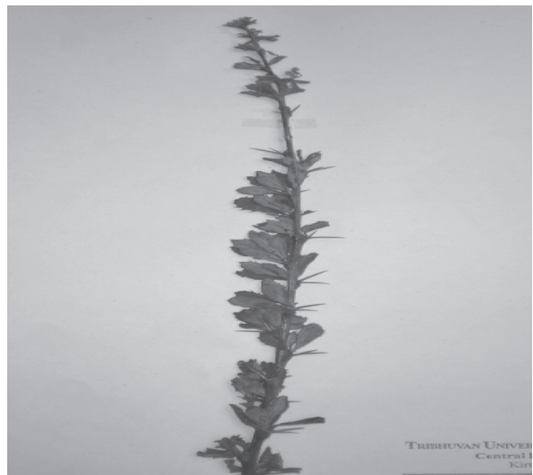
Plate 3- Berberis erythroclada

Much branched spiny shrub, about 1m high, branches grooved, shiny dark red. Leaf stalks, 1-2cm long ovate, margin dentate. Flowers yellow, solitary, on a slender stalk. Fruit red. Flowering: June – July. (Plate 3)