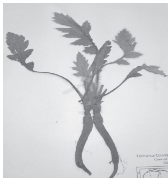
Plate 6- Meconopsis peniculata

Monocarpic herb 1.8m tall, tap root dauciform or narrowly elongated. Stems moderately bristly covered with golden yellow soft hairs. Leaves linear-oblong on outline, deeply pinnatifid or pinnatisect at the base densely clothed with same type of hairs like in stems, segments ovate-oblong, base spatulate, apex acute to obtuse margin coarsely serrate. Flowers solitary terminal or axillary, numerous pendulous, borne singly in upper part in 2-6 flowered lateral cymes in lower part. Ovary sub globose, ellipsoid or ovoid densely covered with hairs. Flowering :June – August, Fruiting time : September- October. (Plate 6)