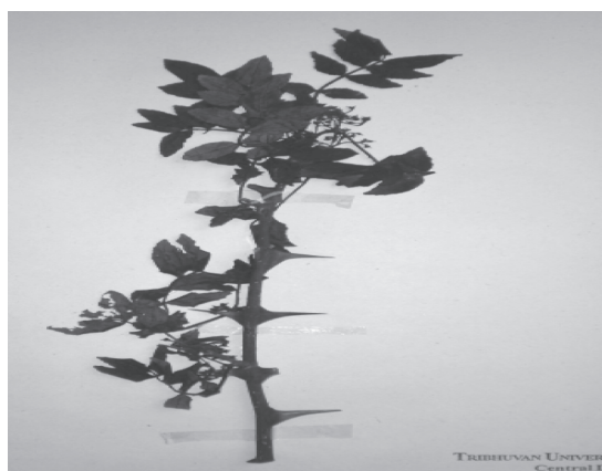
Plate 12 - Zanthoxylum nepalense

Shrub with corky bark and numerous straight spines. Leaves stalked pinnatifid, rachis winged, leaflet short stalked 1-3 cm long, ovate, dentate, gland dotted, flower yellowish, fruit a capsule, globose red and wrinkled. Flowering time: May -June. (Plate 12)