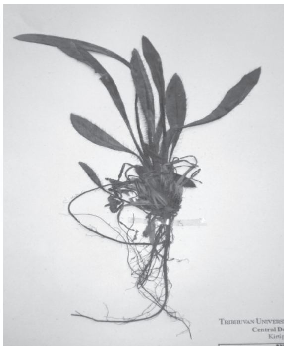
Plate 5- Meconopsis grandis

Polycarpic herb up to 1m high. Tap root narrowly dauciform or root system fibrous. Stems leafy, basal part covered with appressed bristly, membranous persistent leaf sheaths, clothed with reflexed, deflexed, 3-7mm long yellow bristle. Leaf elliptic oblanceolate, long petioles, apex acute, base cuneate or shortly attenuate, margins entire or with several broad teeth. Flowers blue, solitary on axils of upper most leaves. Seed reniform. Flowering: June to July. Fruiting: August – September. (Plate 5)