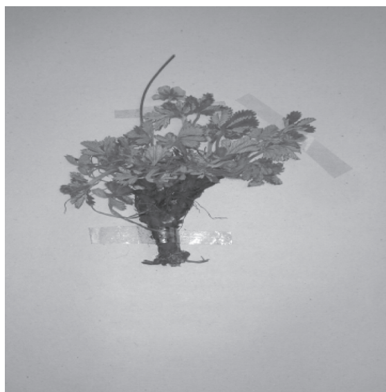
Plate 10- Potentilla peduncularis

Perennial, herbaceous plant about 30cm in height, rootstock stout, covered with old leaf bases. Leaves uniformly pinnate about 20cm long mostly basal covered with silvery hairs appear white at beneath. Flowers yellow, corymbs, flowering and fruiting time July - November. (Plate 10)