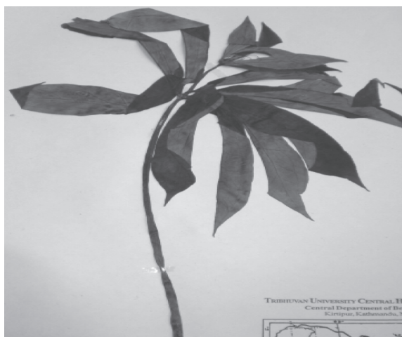
Plate 8- Paris polyphylla

The herb is about 60 cm high. Leaves stalked, in a whorl at the top of the stem, 5-16 cm long, 1.5-4 cm wide, lanceolate, long-pointed, dark green. Flowers solitary, Flowering time: April-May. (Plate 8)