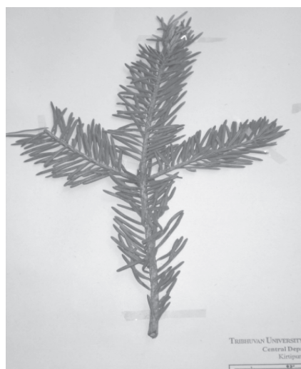
Plate 1 - Abies spectabilis

Tall evergreen, coniferous tree about 50m in height. Leaves sessile, linear, flattened, leathery, dark green above and whitish beneath with incurved margins, notched at the apex. Flowers unisexual, female cones solitary, situated a little below the tips of shoots, dark purple when young and brown at maturity with broad fan shaped scales, erect cylindrical, 10-20 cm long and 4-7.5 cm broad. Male cones usually clustered, yellowish and ellipsoid, 5cm long. Cones: April- May. (Plate 1)