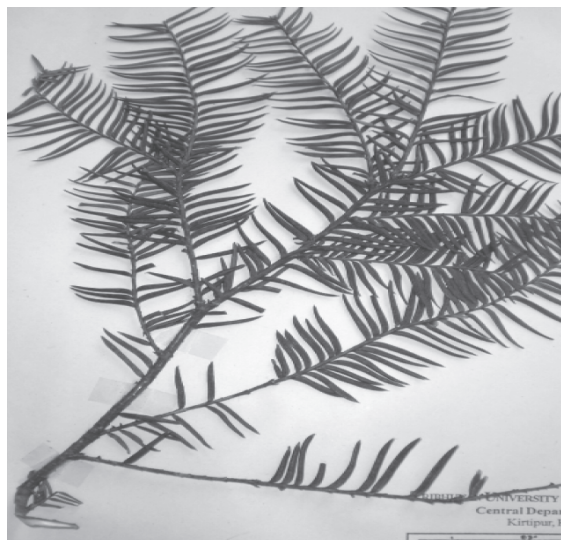
Plate 11- Taxus wallichiana

Evergreen much branched coniferous tree nearly 30m tall. Bark reddish brown, rough, exfoliating in irregular papery scales. Leaves linear, short- stalked, flat, acute, distichous, shiny dark green above, rusty beneath and narrowed towards the base, 2-3.5 cm long and 3mm broad. Flowers unisexual, male flowers in short stalk, globose catkins in axils of leaves; female flowers solitary, axillary, green. Cones yellowish, axillary. Fruits or seed cones are red fleshy, 8mm in diameter. Seeds are olive green. (Plate 11)