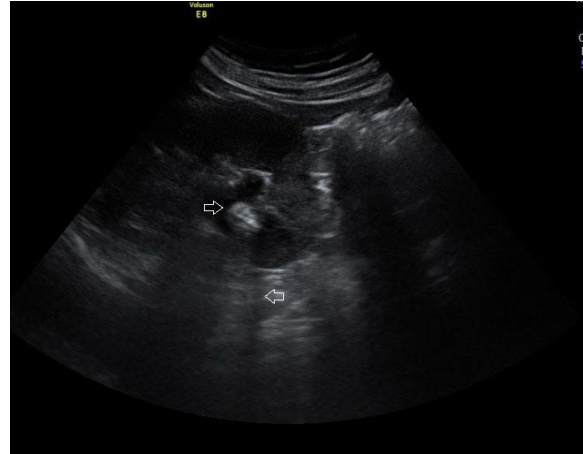
Fig. 2a: The ultrasound image shows an echogenicity in the lower pole of left kidney with subtle posterior acoustic shadowing, suggestive of a calculus.

Apparently there is nothing unusual in the above cases because false negative and false positive results are well known with imaging modalities, particularly radiography and ultrasonography. However, these limitations of imaging can lead to errors which in-turn can lead to medico-legal issues. Irrespective of their level of experience and expertise, most radiologists would agree of having faced the brunt of imaging errors in one way or the other.