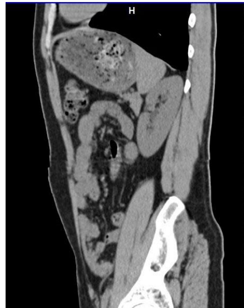
Fig. 2b: The CT study however did not reveal any calculus.

People undergo health check-ups so that diseases get diagnosed before they become clinically manifest. Hence, missing a tumor in early stage would be exactly contradictory to the basic tenet of preventive health check-up. Due to absence of symptoms, such missed lesions are likely to go undetected till late. Since missing a lesion in pre-clinical stage can have a direct bearing upon the final prognosis, it may invoke medico-legal