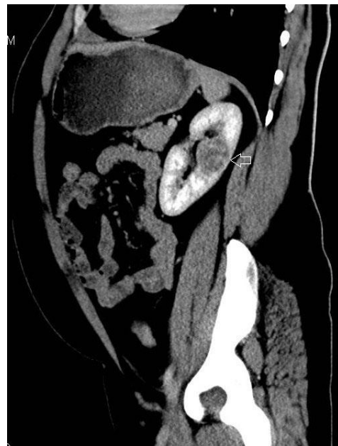
Fig. 1b: The CT study reveals a focal, mildly enhancing mass lesion suggestive of a neoplastic etiology.