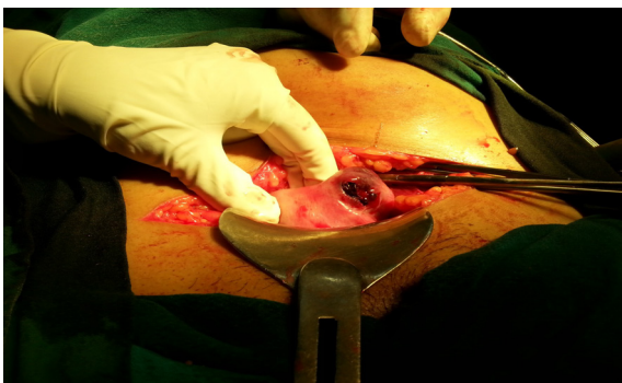
Figure 2-3. Case 2: Cornual ectopic pregnancy.