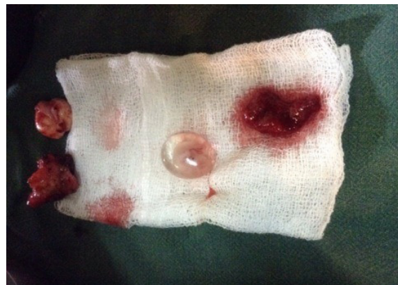
Figure 1. Case 1: Intact gestational sac of cornual ectopic pregnancy.

weeks with fetal pole and cardiac activity at cornual junction suggesting cornual pregnancy. Emergency laparotomy was done with right cornual resection and repair with left tubal ligation under subarachnoid block. There was hemoperitoneum of about 50 ml, left cornual pregnancy sized 6x4 cm with trickling blood, and round ligament was in the middle at its base. There were multiple subserous fibroids 3x3 cm near cornual ectopic area and another one 4x4 cm at anterior wall of uterus. Uterus was soft and enlarged. Left tube and both ovaries were normal. Total blood loss was 200 ml. Her post-operative period was uneventful and discharged on 7 th postoperative day. Histopathology was reported as cornual ectopic pregnancy.