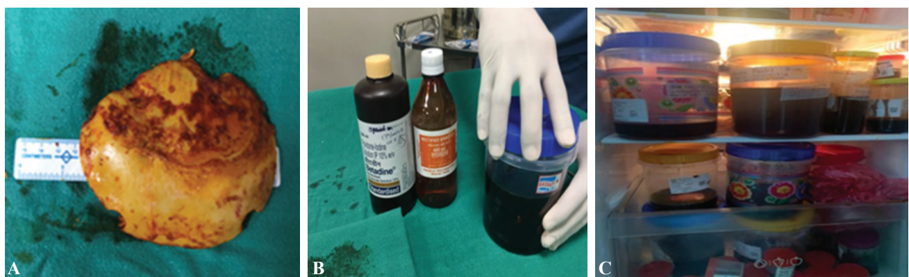
Figure 1: Preservation technique

Figure 1A: (bone flap measuring L=12-13cm, B=8-9 cm), Figure 1B: (povidone-iodine solution IP 10% and ethyl alcohol B.P 90 % in a sterile container with bone flap submerged), Figure 1C: (preservation in refrigerator with patient's particulars).