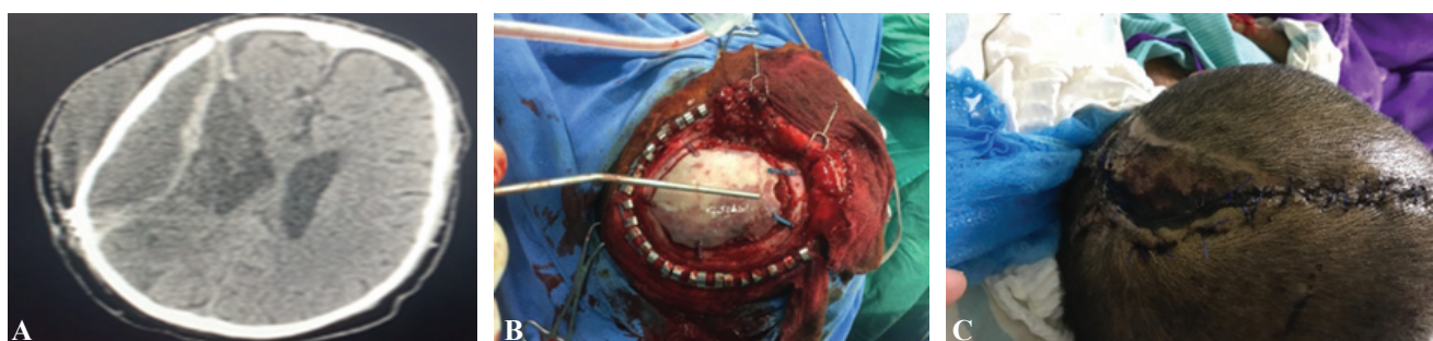
Figure 2: Complications

Figure 1A: (bone flap measuring L=12-13cm, B=8-9 cm), Figure 1B: (povidone-iodine solution IP 10% and ethyl alcohol B.P 90 % in a sterile container with bone flap submerged), Figure 1C: (preservation in refrigerator with patient's particulars).