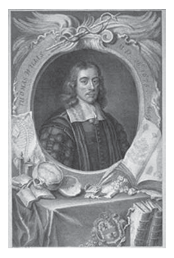
Figure 1. Dr. Thomas Willis. [With permission from SenGupta RA, McAllister VL (eds). Anatomy of cerebral vessels in Subarachnoid Hemorrhages. Springer-Verlog, Berlin, Heidelberg, New York, 1988]