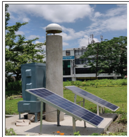
Figure 1: CORS Station at Survey Department, Nepal

In principle, CORS are very similar to GNSS/GPS instrument that capture signals from GNSS satellites. However, in practice, these are designed in a much rugged manner to be able to operate continuously considering factors such as security, power supply, storage, weather, etc. More importantly, communication facilities is installed for data transfer as well as monitoring of the stations. Figure 1 shows a typical CORS station. This station is established within the premises of Survey Department, Nepal.