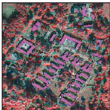
Figure 5: Extracted Building Footprint

The refined building features were export in vector format in polygon feature and finally get the actual extracted building (in Figure 5).