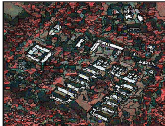
Figure 3: Multi-resolution Segmentation

The buildings in the image have different spectral properties and not pre- defined parameters of scale, shape, color which were equally applicable to get best fitting segments for all building footprints. In this study, a set of parameters was chosen by trial and error method, for the extraction of building footprint which fits practically in the image. Some considerations have taken in mind that the image has not be over or under segmented and over segmentation. The multi-resolution segmentation, scale 20, shapes 0.3 and compactness 0.6 was used as a parameter set (in Figure 3).