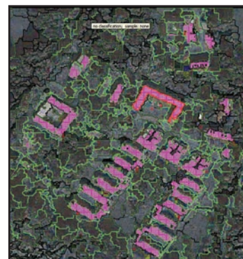
Figure 4: Refinement of Building Footprint

In rule based classification, nDSM was used for separation of taller objects in the image which may be vegetation or building. Vegetation was separated by using NDVI and shadow was extracted using SSI and NDWI. The refinement was done with the membership function of the fuzzy logic with some threshold and optimization of the rule set in feature space of spectral (brightness, standard deviations,