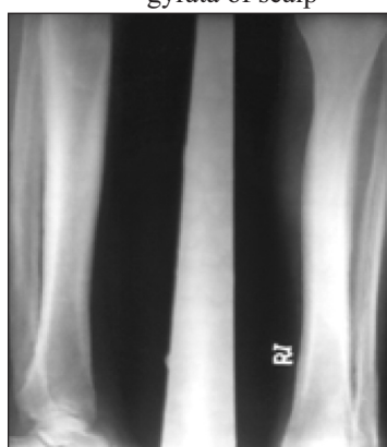
Figure 5: Subperiosteal ossification of long bones