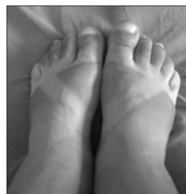
Figure 3: Clubbing of toes