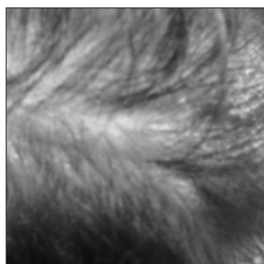
Figure 2: Cutis verticis gyrata of scalp