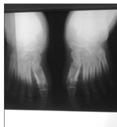
Figure 6: Soft tissue swelling

On examination patient was 160 cms tall and 51 kg by weight with normal nutritional status. Lymph nodes were not enlarged. Clubbing was noted in all fingers and toes (Figure 3 and 4). Coarsening facial features due to thickened and furrowed greasy skin of the scalp and face was noted. Skin thickening was also prominent over