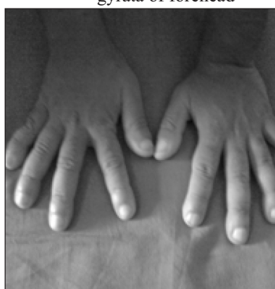
Figure 4: Clubbing of fingers