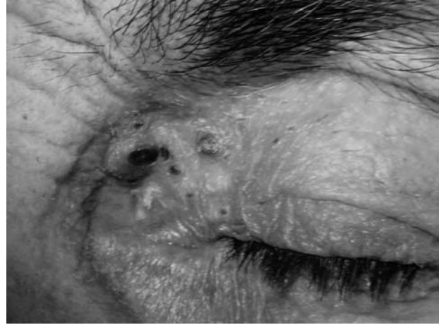
Fig 2 : Senile Comedones