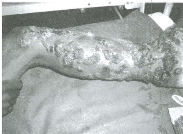
Fig.1. Irregular warty plaques and nodules involving whole of left leg and proximal part of dorsal foot.

like fungating mass with oozing of sero-sanguinous and purulent foul smelling discharge with rolled out border on the lateral malleolar region with maggots wriggling within the lesion (Figures 1 & 2). There was ipsilateral inguinal lymphadenopathy. Two lymph nodes of 2x2 cm each were palpable which were non-tender, discrete, hard and fixed with the underlying structure. Systemic examination revealed no abnormality.