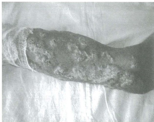
Fig. 3. After 1 week of itraconazole therapy.

Based on the clinical features and positive KOH preparation we diagnosed this as a case of Chromoblastomycosis and started Itraconazole 100 mg twice daily along with daily normal saline dressing after irrigation with hydrogen peroxide solution. About 2 dozen maggots were extracted from the ulcer. Cefadroxil 500 mg twice daily was given for 7 days. There was dramatic improvement of the lesions within a week of starting itraconazole (Figure 3), and it continued to show improvement in the successive weeks with all the hyperkeratosis gone and erythematous plaque remaining (Figure 4). The patient continued to show improvement during the hospital stay and he was discharged with the advice to report if there was any complication or relapse. The patient has not turned up again until now.