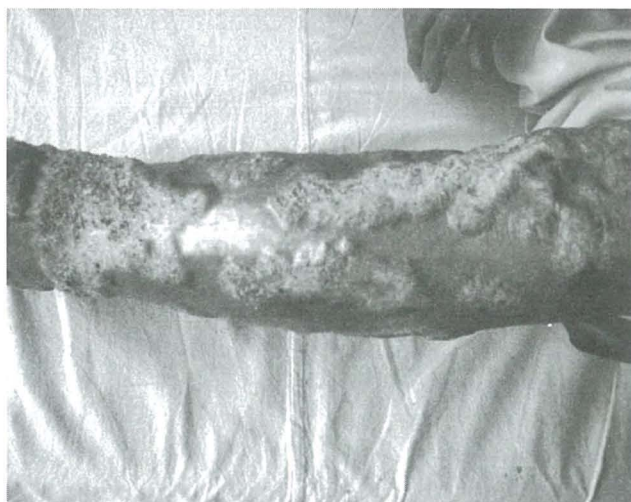
Fig. 4. After 4 weeks of treatment with itraconazole.