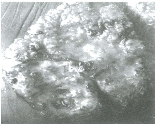
Fig. 2. A fungating ulcerated mass with maggots around left lateral malleolus.

We admitted the patient for further investigation and performed routine blood tests, gram stain showed gram positive coccobacilli and culture of the pus yielded mixed growth of organisms. Mantoux test and HIV antibody test were negative; chest x-ray was normal.