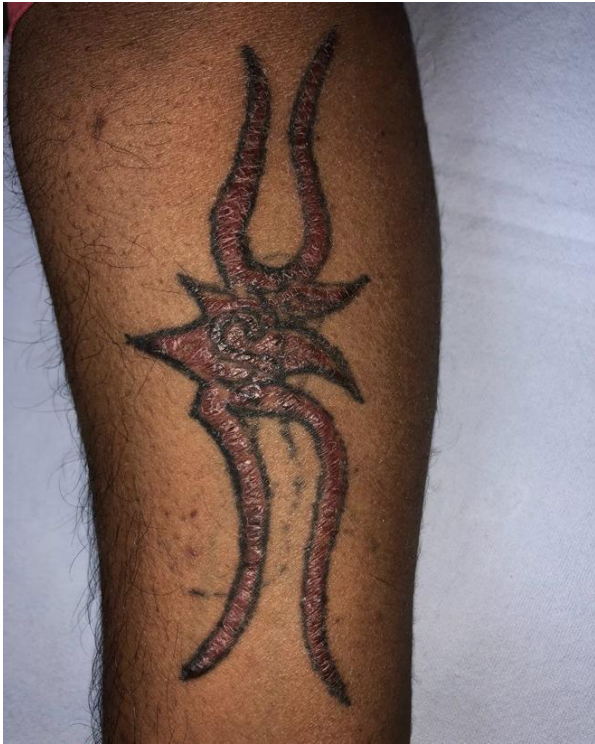
Figure-1: Erythematous plaque with atrophy and scaling over the tattoo confined to margin

of starting antitubercular therapy category-I by the department of Revised National TB Control Programme (RNTCP) comprising rifampicin, isoniazid, ethambutol and pyrazinamide, clinical improvement was seen with resolution of the erythematous plaque (Figure-3). Rifampicin, isoniazid, ethambutol and pyrazinamide were given for the first 2 months followed by rifampicin and isoniazid for 4 months.