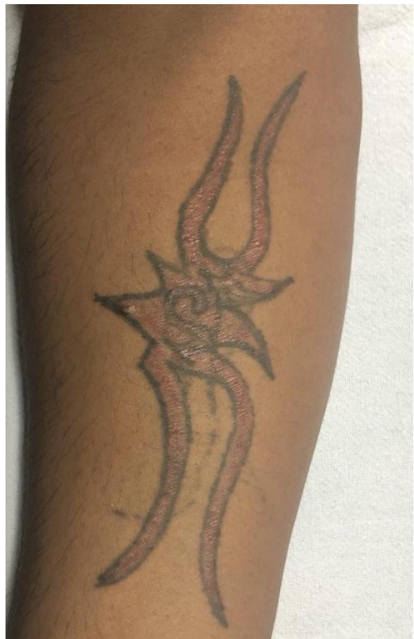
Figure-3: Clinical improvement of lesion after 6 months of anti-tubercular treatment