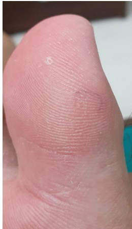
Figure 1: Black, semi-circular thread-like lesion on medial plantar aspect of right great toe