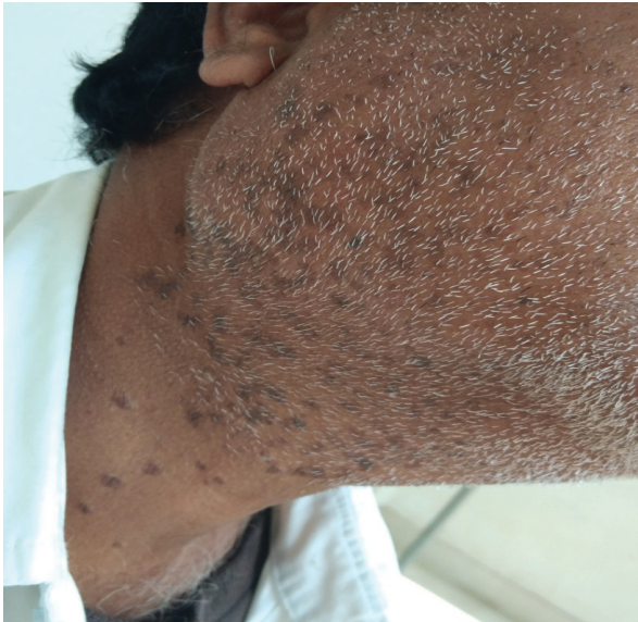
Baseline photo (Prior to Electrosurgery)