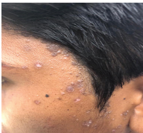
1 week post tretinoin