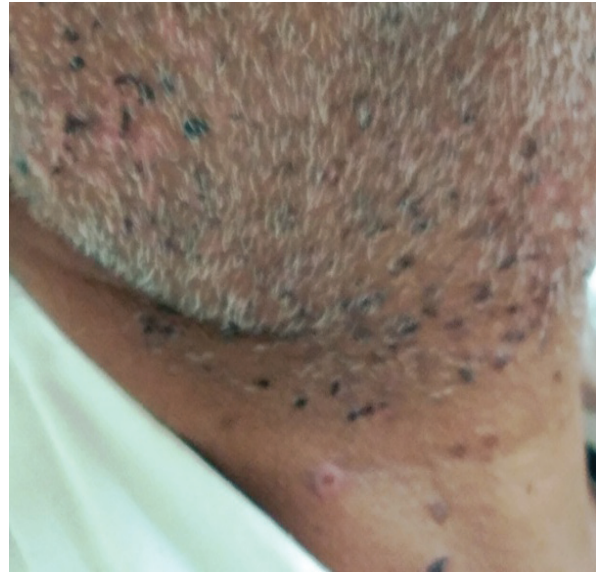
1 week post electrosurgery