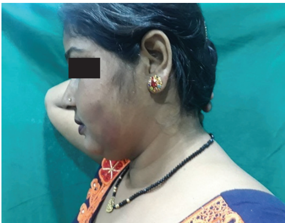
Figure 3: Buffalo hump before treatment