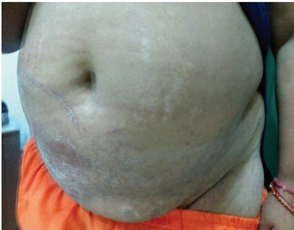
Figure 1: Tinea corporis, Abdominal striae and central obesity before treatment

Patient was started on oral itraconazole 200mg twice daily, butenafine cream twice daily, clotrimazole dusting powder, oral anti histaminic and calcium supplementation. Topical steroid was discontinued. After three months, Patient lost 11 kg weight, her blood pressure normalized. Buffalo hump (Fig 2), Abdominalstriae (fig 4) and hypertrichosis reduced to a great extent. The HbA1c and 8 am cortisol normalized to 5.2% and 9.66 µg/dl respectively.