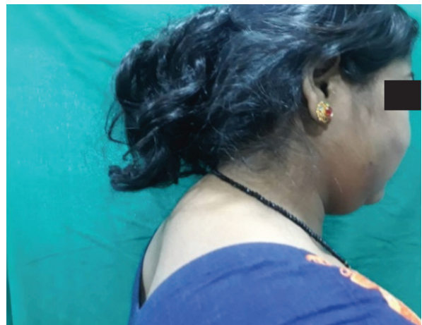
Figure 4: Buffalo hump after treatment