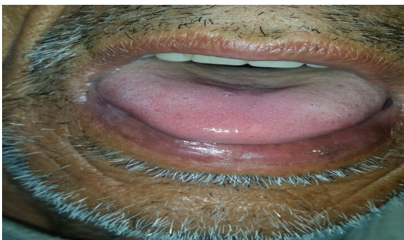
Figure 3: BHT after 8 weeks of discontinuation of lansoprazole