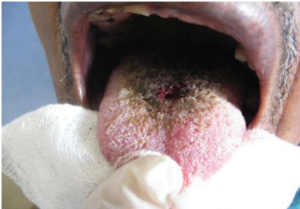
Figure 1: BHT on dorsum of tongue with 4mm punch biopsy

Clinically and histopathologically diagnosis of BHT was made. Patients was advised to stop lansoprazole along with cessation of smoking along with gentle tongue debridement with soft toothbrush and was referred to dental department for assessment and management of oral cavity. On follow up after 8 weeks (fig:3), there was resolving BHT with almost normal texture. Hence final diagnosis was Black Hairy Tongue (Clinically: Lansoprazole induced).