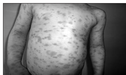
Figure 1: Multiple sharply defined red brown maculopapules and plaques on the trunk and limbs

of two year duration. There was also a history of generalized urticarial flushing with occasional bulla formation. He had been delivered with cesarean section at full term without any complication. The general health, growth and development of the child was unaffected. There was no family history of similar disease or any other dermatological or autoimmune disease. Therapy with topical corticosteroids prescribed by the general practitioner had shown no effect. Physical examination of the patient was normal. Systemic examination of the patient also revealed no abnormality. There was no hepatomegaly, splenomegaly or lymphadenopathy. Cutaneous examination of the child revealed multiple, sharply defined, red brown maculopapules and plaques on the trunk and limbs (Figure 1).