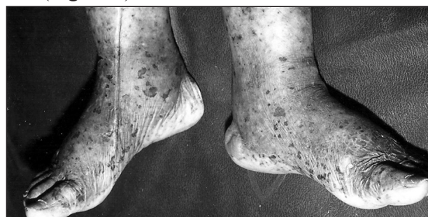
Figure 1: HSP with haemorrhagic bullae

Palpable purpuric lesions were the main clinical presentation of the disease (100%). Palpable purpura with hemorrhagic bullae were present in 6% (Figure 1).