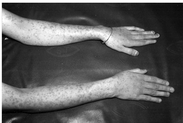
Figure 3: Palpable purpura on upper limbs

Seventy Four percentage of the patients had upper respiratory tract infections. Pain during micturation was also noted in 8%.