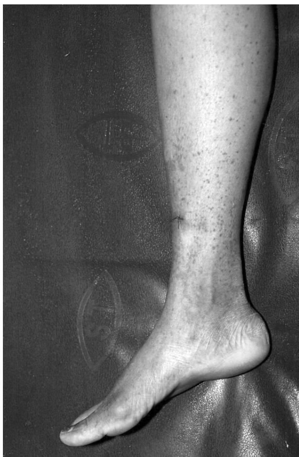
Figure 2: Palpable purpura on lower limb

The lesions were pruritic in 58% and pain along with pruritus noted in 2%. Lesions were mostly concentrated on extensor aspect of the extremities. Fifty two percentage were on the extensor aspect of the lower limb (Figure 2 ) and 12% on extensor aspect of the upper limb (Figure 3) and lower limb. Truncal involvement was minimal (2%).