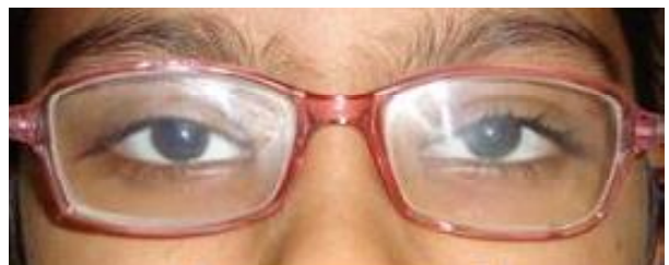
Figure 3: Final clinical photograph of the child at 12 years of age showing aligned eyes with glasses (photograph of the child published with due consent of parents). The corneal parameters at this stage are the same as in figure 1 with no further progression of corneal ectasia.