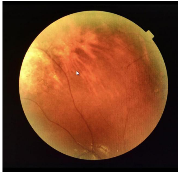
Figure 4: Chorioretinal scar seen 3 months after anti-tubercular treatment.

Pokhara. There was a subsequent improvement in the patient's symptom and resolution of the choroidal tuberculoma to a scar at three months of ATT (Figure 4). The best corrected visual acuity of both eyes showed 6/6.