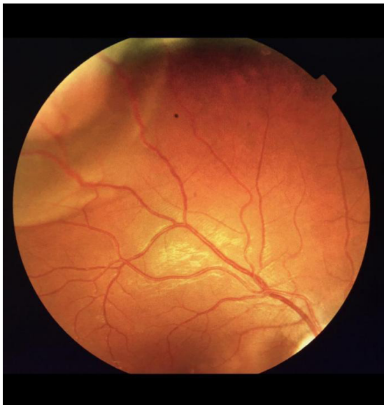
Figure 1: Choroidal mass with surrounding retinal detachment at the superotemporal quadrant on first examination.

Routine blood tests for uveitis - complete blood count (CBC), erythrocyte sedimentation rate (ESR), serum angiotensin converting enzyme (ACE) and serum calcium were all within normal limits. Antinuclear antibody (ANA), Venereal disease research laboratory test (VDRL), Human immunodeficiency virus (HIV) and Hepatitis