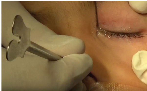
Figure 2: Lacrimal probing with Bowman probe. Permeability is checked by contacting it with grooved director introduced in nasal cavity.