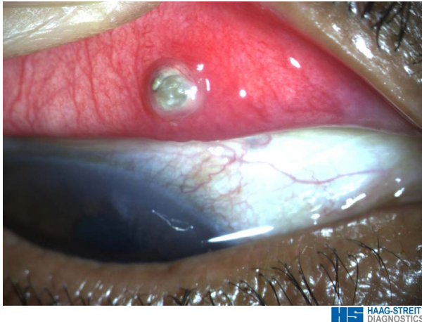
Figure 1 A: Clinical picture of the lesion on right upper lid palpebral conjunctiva showing blackish-brown mass protruding out and surrounded by hyperaemia.

a solid foreign body. Histopathology revealed stratified squamous epithelium with florid hyperkeratosis (Figure 1B). Superficial layer of keratin showed presence of ghost cells. Haemorrhage was noted inside the mass. There was no evidence of granuloma, dysplasia or malignancy. Histopathological features were suggestive of epidermal inclusion cyst of the conjunctiva.