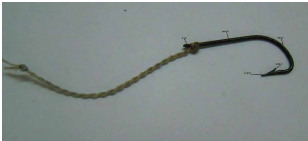
Figure 4: The fish hook which penetrated the globe