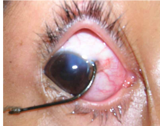
Figure 1: Fish hook penetrating right eye near limbus.(Reproduced from, Sure Success in Ophthalmology Viva-Voce and Practical Examination 2013,by Dutta J and Chakraborti C(New Delhi) Plate NO 15 .Copyright JP Brothers Medical Publishers(P) Ltd.

and perhaps more important than the method of hook extraction is the need for prompt, appropriate surgical intervention.