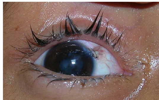
Figure 2: Coronal CT scan of right eye showing the fish hook.