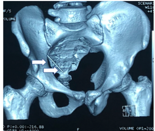
Figure 1. 3D CT showing foreign body in the right lower pelvis (Pointed in white arrows)

A 26 years old serving soldier was referred to us from the Department of Orthopedics with a history of an accidental intraabdominal sewing needle insertion. During history taking, he could not exactly recall how the needle got there, but he gave history of accidental needle prick sensation on his right lower abdomen one month back while lying on the bed. We presumed that the needle migrated slowly to the present location intrabdominally. Even though patient was asymptomatic initially, he later complained of right lower abdominal pain which was sharp “needle prick” type in character, episodic and was aggravated by certain movements or postures like bending forward. His bowel and bladder habits were normal. On abdominal examination, there was tenderness in right lower quadrant. There was no guarding, rigidity or rebound tenderness. His laboratory parameters were within normal limits. Ultrasonography of abdomen and pelvis revealed a 3.5 cm long needle-like, hyperechoic metallic object in right lower abdomen suggestive of foreign body. This was followed by plain abdominal X-ray which showed around 4 centimetres needle like, radio opaque shadow in lower abdomen slightly left to the midline. Abdominal computed tomography (CT) scan suggested the presence of intraabdominal metallic foreign body close to caecum which was of similar morphology as seen in ultrasound and X-Ray Figure 1.