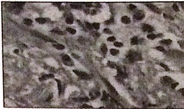
Figure 3: (Magnified view of perifollicular region)

counseling that the hair may restart falling and if so to inform the doctor at the earliest. Folliculitis decalvans is known to be recalcitrant to treatment.