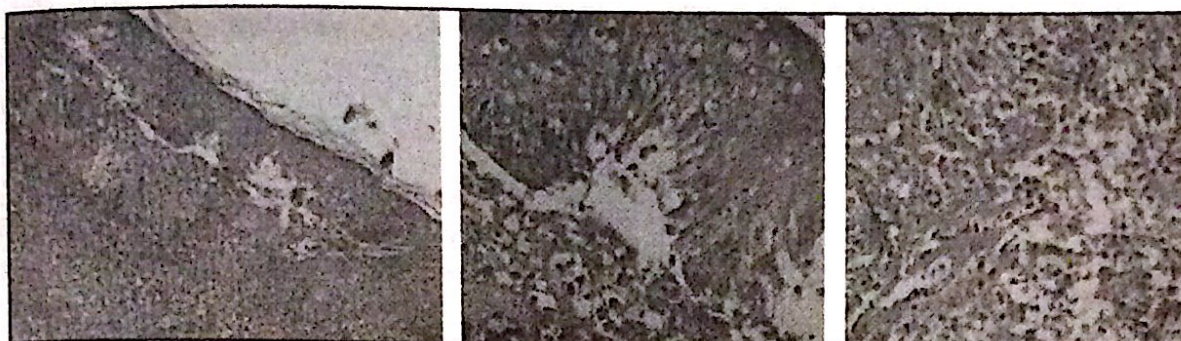
Figure 5: (A = Photomicrograph showing diffuse and nodular dermatitis with many neutrophils with lysis of superficial dermis, B = Magnified view of A showing intra-epidermal neutrophils, C = Nuclear dusts, the neutrophils and lymphocytes at the superficial dermis)