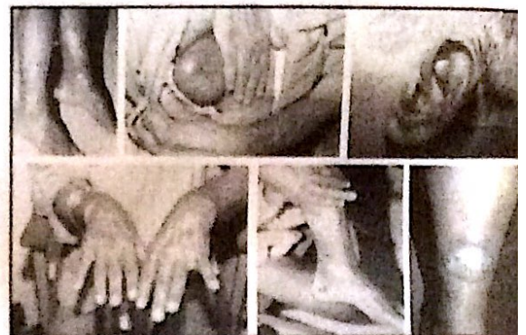
Figure 4: A= Old healed scars over both lower limbs B= Ulcers over the scrotum, C= Nodules over pinna, D = Scars and ulcers over both hands, E = New pustules over ankle, F = Healing over shin of leg)

Old healed scars were seen over all 4 limbs.