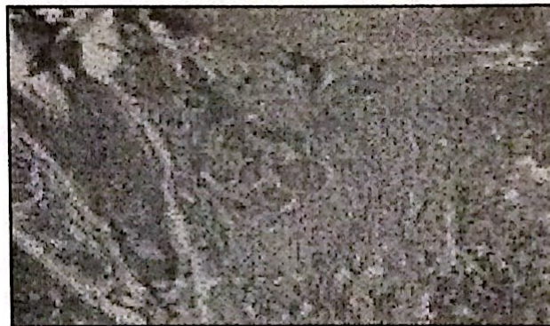
Figure 2: (Microphotograph showing Sheets of, plasma cells, lymphocytes, a few neutrophils at perifollicular region)

Sheets of, plasma cells, lymphocytes, a few neutrophils perifollicular region